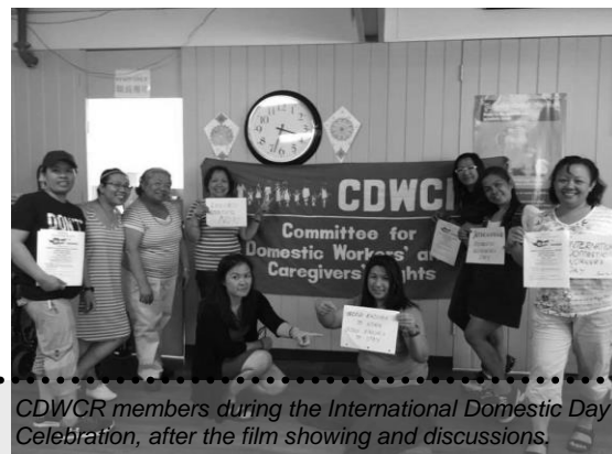
CDWCR members during the International Domestic Day Celebration, after the film showing and discussions.