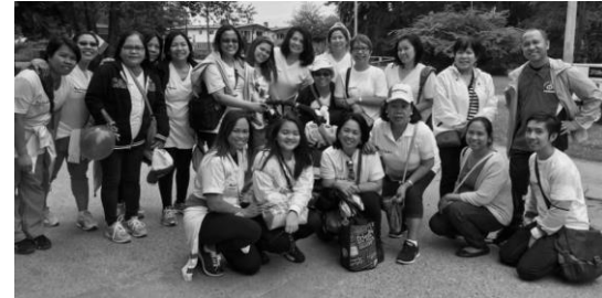
Participants of the CDWCR Caregivers Walk for Landed Status

Since CDWCR's inception as an organization, it has been advocating for permanent residency status for foreign domestic workers and caregivers upon their arrival in Canada.